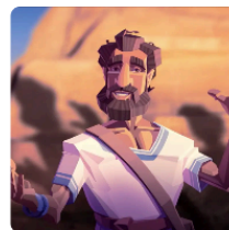
VIDEO SERIES Share